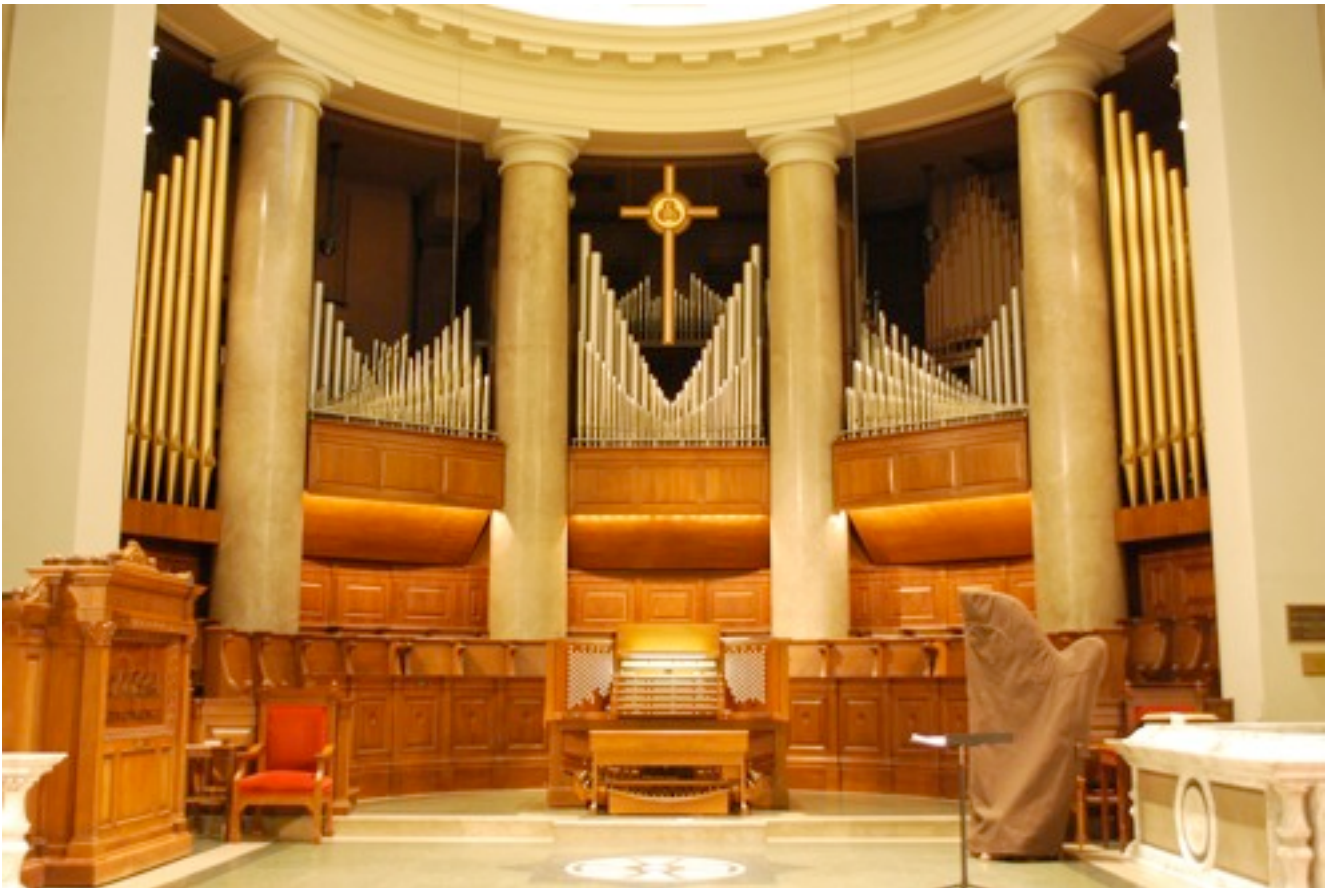
The sanctuary of National City Christian Church.