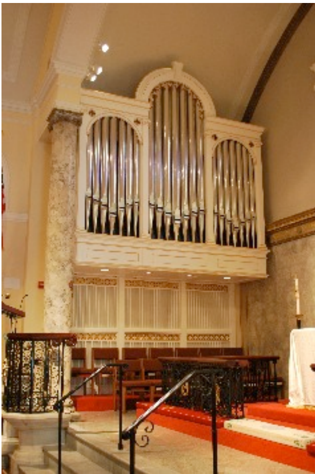
Case of the 2009 Lively-Fulcher Pipe Organ.