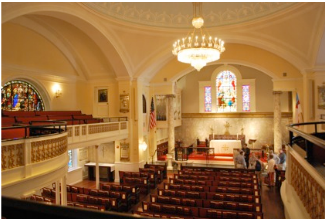
Overall view of the interior of St. John's - Lafayette Square