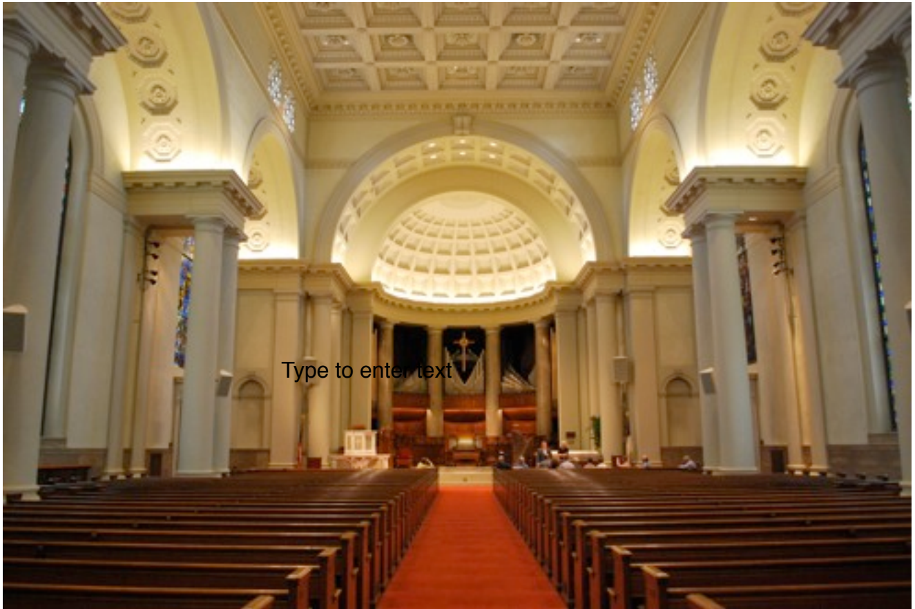
Interior of National City Christian Church (Disciples of Christ) in Washington, D.C.