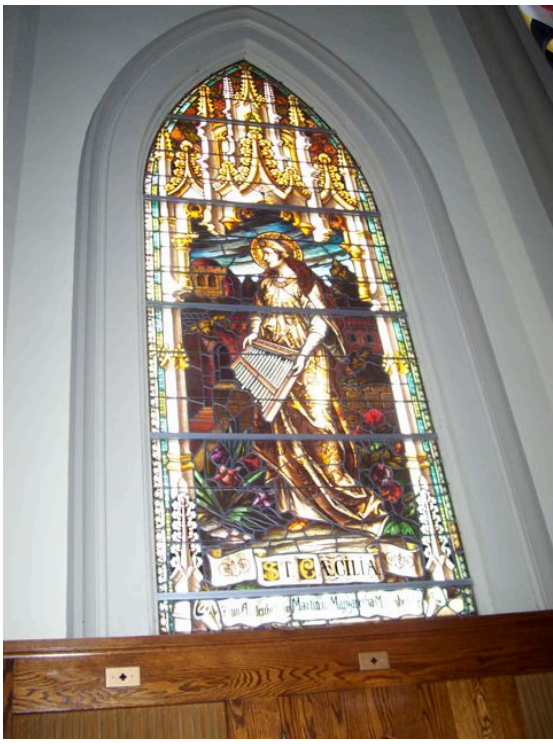
St. Cecelia Window Saints Peter and Paul Catholic Church Cumberland, MD

After the demonstration of the organ, we returned to our cars and drove down the steep hill to the Western Maryland Train Station. All of us got our reserved tickets and waited on the platform for the steam engine to arrive at the station. Since there were many groups riding the train there were fifteen passenger and diner cars, and the caboose. This was too much for the steam engine to pull. Two diesel engines were added to the back of the train to push because of the steep grade to Frostburg. The trip takes about an hour to Frostburg and even though the skies were gray we still saw the beautiful fall foliage as we traveled up a steep hill to the Frostburg Train Station. Upon arriving in Frostburg we had an hour and a half layover before the trip back to Cumberland. Some members stayed in the station area and ate lunch at a few different venues. Others walked up the steep hill to the downtown area and sought out the number of restaurants on Main Street. Of the number of churches on Main Street the only church open was St. Michael's Catholic. This author found the gallery open and found an Allen Organ from the 1970's. (I did not turn it on and play.) The pastor of this church was a former associate pastor at St. Ursula's in Parkville who is an organ enthusiast. Hopefully someday St. Michael's will acquire a pipe organ. There is plenty of room in the gallery for an instrument. The walk back down the hill to the station saw the steam engine on the roundtable