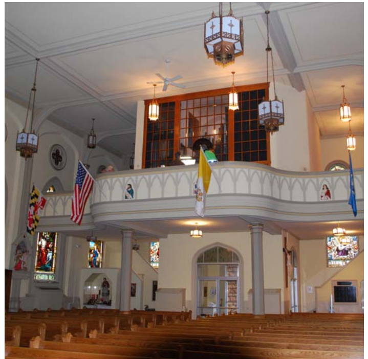
A view of the Gallery and the Chamber Opening