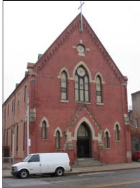
Abbott's Memorial Church