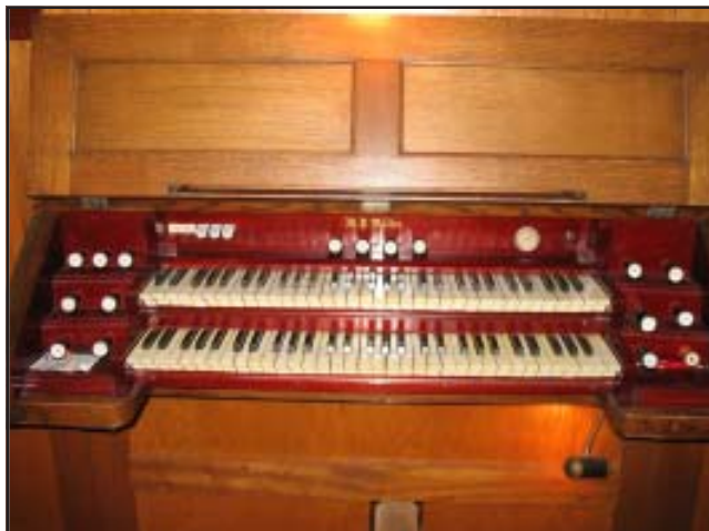
Luther Memorial keydesk