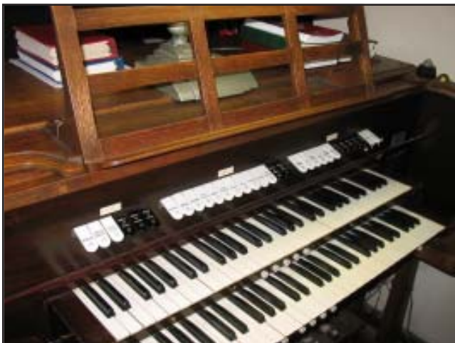
Nazareth Lutheran console

The church has an altar area [chancel] set off from the nave by an arch, and the organ is in a room high up on the north wall of the chancel. There is a single chamber with swell shades across the opening. Most of the area of the room is chest with the stops, for the most part, parallel to the opening; there are some offset chests on the walls.