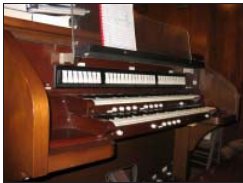
Abbott's Memorial console

The interior of the church is much modernized from its original interior, and what looks to be a large high-vaulted nave from the exterior is actually low-ceilinged; the church's fellowship hall is upstairs. No organ pipes are visible behind the contemporary façade, and the console is a 1950's console replacing an earlier one damaged by fire. There is no record of when or by whom the organ was electrified.