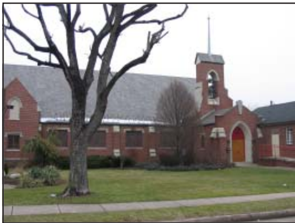
Luther Memorial Church

Although named “Swell”, the second (upper) manual is also unenclosed; the Swell pedal is now a convenient foot rest for the organist.