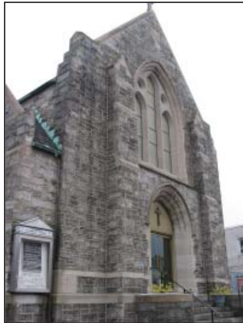
Nazareth Lutheran Church

The church has an altar area [chancel] set off from the nave by an arch, and the organ is in a room high up on the north wall of the chancel. There is a single chamber with swell shades across the opening. Most of the area of the room is chest with the stops, for the most part, parallel to the opening; there are some offset chests on the walls.