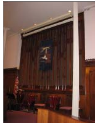
Abbott's Memorial organ façade

Speculation among the church members eventually led to the discovery, inside the organ itself, of a nameplate on a wind trunk below one of the chests: M. P Möller, Hagerstown, Md. U.S.A. Opus 2523 – 1918.