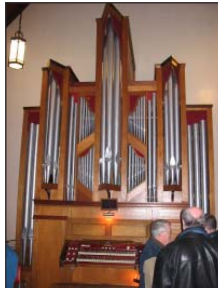
Luther Memorial façade