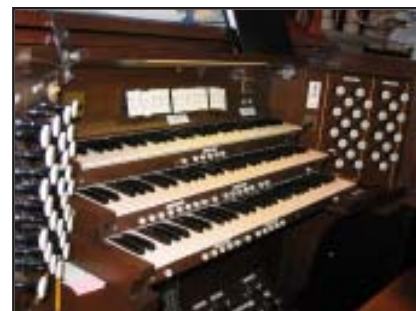
Gallery Console (1969)