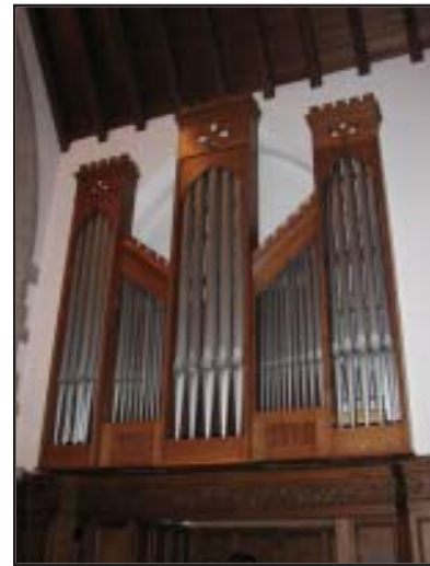
St. Bartholomew south façade

Soubasse Acoustique 32' Flûte 16' Violone 16' Soubasse 16' Bourdon 16' (GO) Octavebasse 8' Violoncelle 8' Bourdon 8' Octave 4' Flûte Ouverte 4' (GO) Grand Cornet 32' Trombone 16' (prep.) Bombarde 16' (GO) Basson 16' (REC) Clarinettebasse 16' (POS) Trompette 8' (GO) Basson 8' (REC) Clairon 4' (REC) Clarinette 4' (REC)