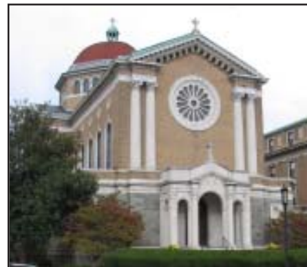
Our Lady of the Angels Chapel