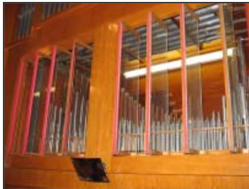
St. Paul Lutheran glass Swell shutters