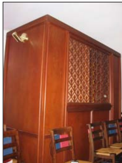
Port Republic organ case

"The Church knew what the Psalmist knew: Music praises God. Music is well or better able to praise Him than the building of the church and all its decoration; it is the Church's greatest ornament."