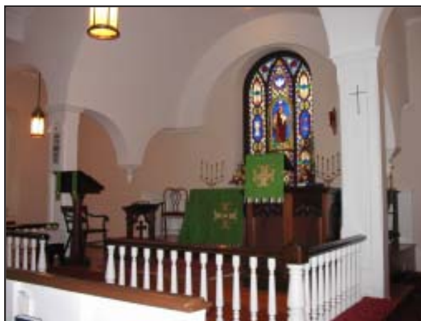
Port Republic Chancel, showing Baptistry area to the left

Make sure we have your correct mailing address and your e-mail address; unless you request otherwise, your newsletters will be delivered electronically.