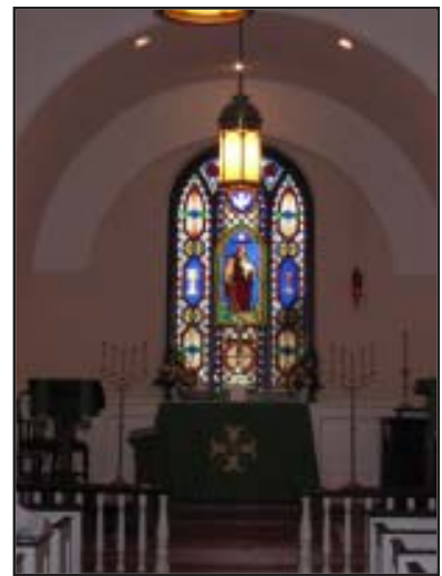
Port Republic chancel

The organ is by M. P. Möller : a three-rank Artiste built for the church in 1959. The console was originally located in the Baptistry area adjacent to the Altar; it was moved to the gallery about 1990. Subsequently Paul Fulcher revoiced this organ in order to secure more presence in the room. It is installed in a standard cabinet and all ranks are under expression.