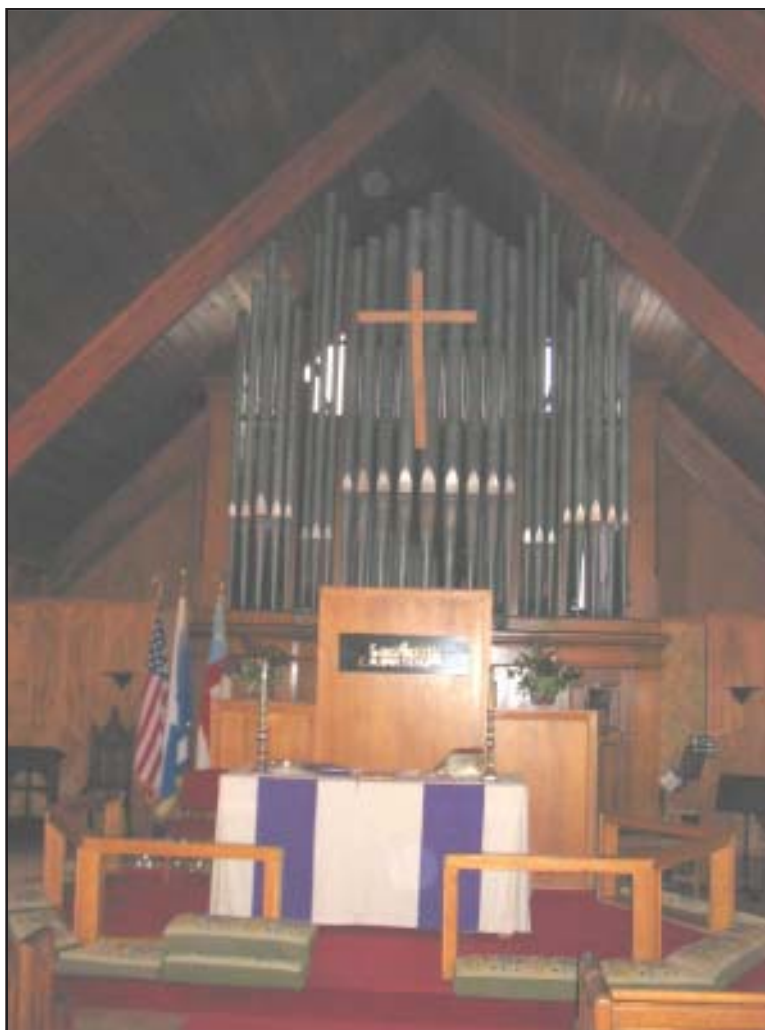
All Saints' Hook & Hastings

The organ is very well located behind the altar and facing directly out into the length of the building. Its sound commands the attention of the congregation and leads their singing with authority. There is no great reverberation, but there is a kind of warmth that mixes and blends well with the brown wooden surfaces of the building's interior. The instrument appears to be built so well as to last forever. Of its 15 ranks ten are of 8' pitch, two of 4', one 3', one 2', and two 16'. We have visited this instrument at least three times in the past; there are no electric switches between the player and the sound, so the organist is free to develop a more intimate playing of his music.