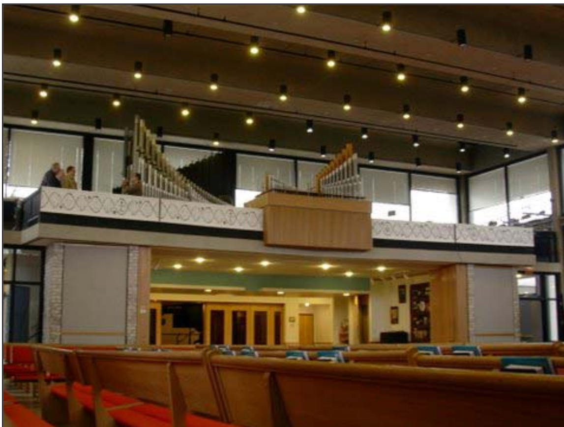
Arlington Unitarian Universalist Holtkamp

Left: General 1-4 Center: Crescendo Pedal Right: Hitch-down SFZ; Pedal 1-4