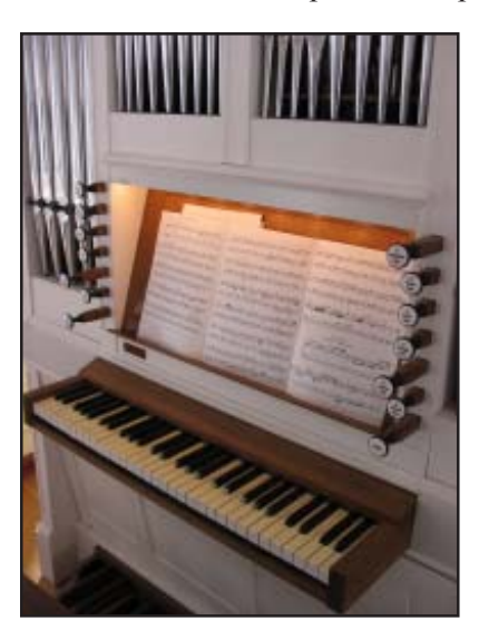
Wahl Organ keydesk

the ensemble and is quite wonderful in effect. The balance among the stops is such that it is also possible to build up the organ, or decrescendo fairly smoothly – desirable in service playing and often an elusive quality of an instrument with no stops under expression.