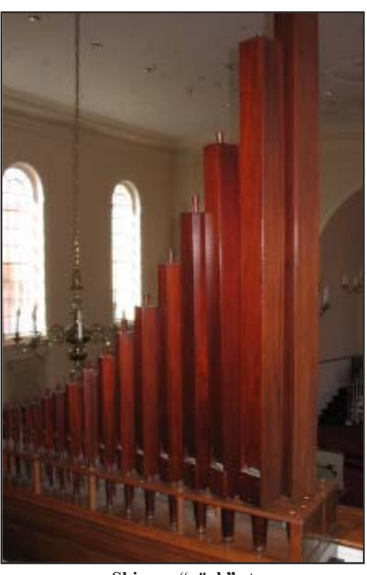
Skinner "rück" stops