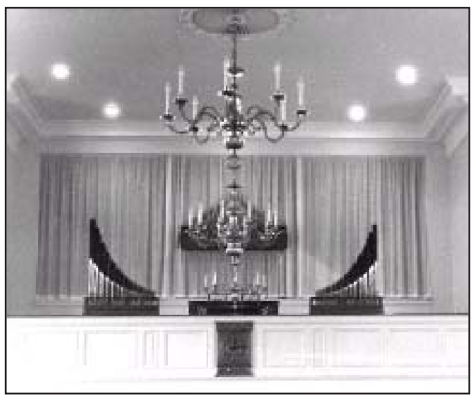
Skinner - original installation before renovation