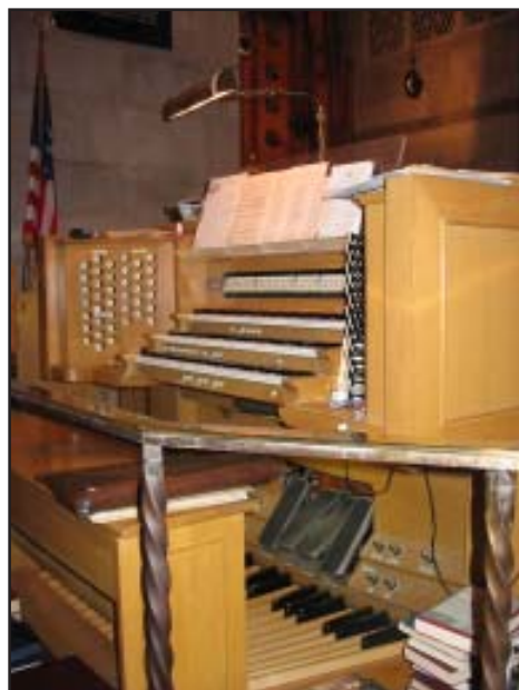
Immanuel Lutheran console