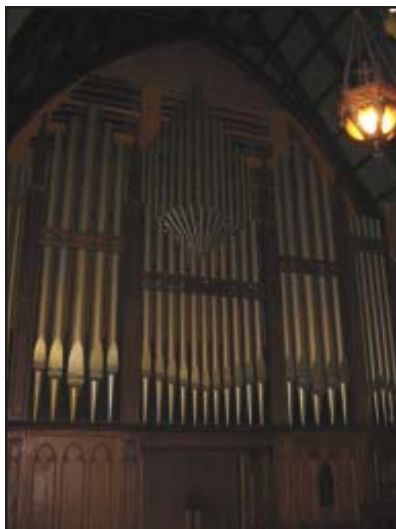
St. John's façade original Pomplitz; modified

Three Manual drawknob console; intermanual couplers at 16' 8' 4'; intramanual couplers at 16' 4' Unison Off; Zimbelstern Reversible; Choir, Swell, Great, and Crescendo Expression Pedals; Choir, Swell, and Great to Pedal reversible pistons and toe studs; eight general pistons and toe studs; six divisional pistons per manual; six pedal toe studs.