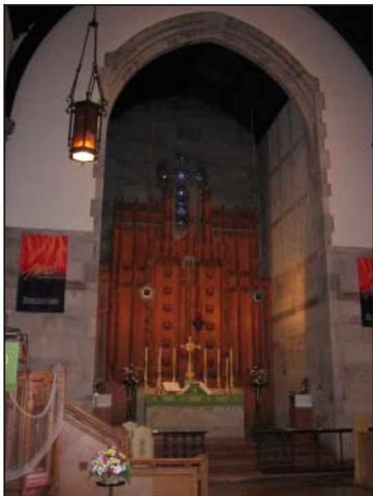
Immanuel Lutheran chancel