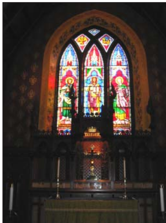
St. John's Episcopal High Altar