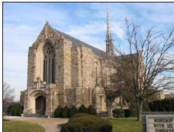
Immanuel Lutheran Church